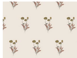
Fabric C SPR-42610 RISING CALENDULA