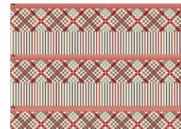
Fabric D (Binding) BIN-SPR-42 SPRUCE BOUND