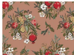
Fabric B SPR-42603 NATURE'S GIFT