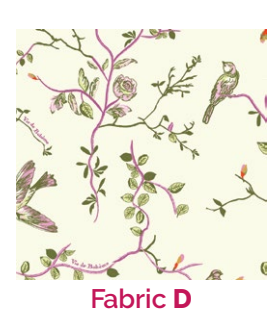
FADRIC D FUSSO2802 VIE DE BOHÈME SOUL by Pat Bravo