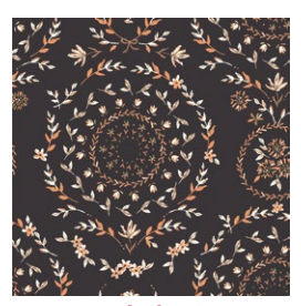
Fabric C FUSSO2809 EIDELWEISS SOUL by Amy Sinibaldi