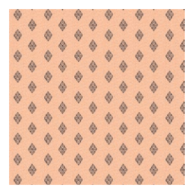
Fabric E FUSSO2808 KUMBU FIBERS SOUL by Katarina Roccella