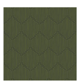
Fabric B FUSSO2804 MINDFUL PATHS SOUL by AGF Studio