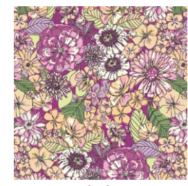
Fabric F FUSSO2803 FLEURON SOUL by Sharon Holland