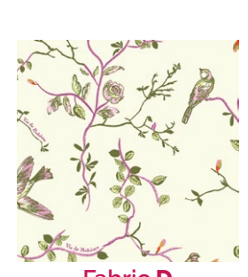
Fusso2802 VIE DE BOHÈME SOUL by Pat Bravo