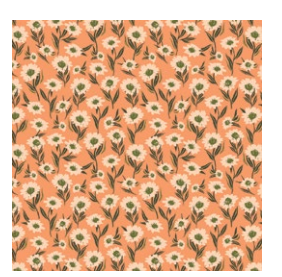
Fabric A FUSSO2805 BOUNTIFUL DAISIES SOUL by Pat Bravo