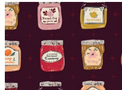
SSP-26609 SWEETENED JAMS