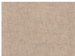
DEN-L-4000 SOFT SAND