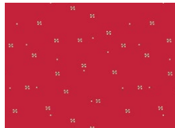
SSP-26607 SEEDED CRANBERRY