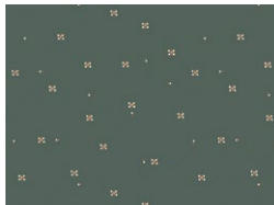
SSP-26601 SEEDED EUCALYPTUS