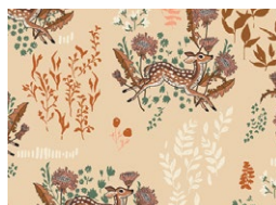
WFG-77604 DANDELION DOE