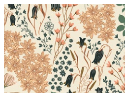
WFG-77613 BLUEBELLS AND BUTTERCUPS