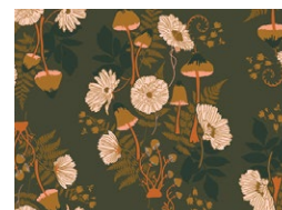
WFG-77609 FERN & FUNGUS ACORN