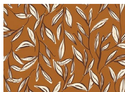
WFG-77615 VINE STARLING