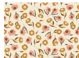
WFG-77605 NECTAR WILLOW