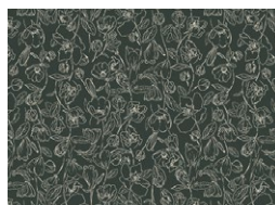
WFG-77614 CROCUS RAVEN