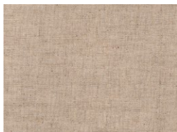
DEN-L-4000 SOFT SAND