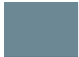
FS-201 RETRO BLUE