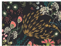
F-56302-1 MEADOW UMBRAR