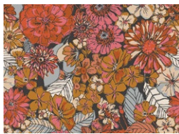
F-73300 FLEURON HAVEN