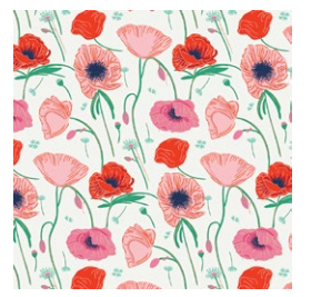
FWR-34884 POPPY HILL