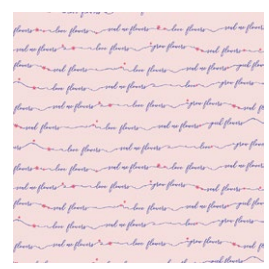
FWR-34887 SEND ME FLOWERS