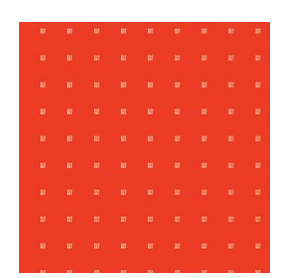
FWR-34883 SEED PACKETS