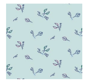
FWR-34889 FRESHLY CUT