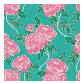
FWR-34880 FLOURISHING PEONIES