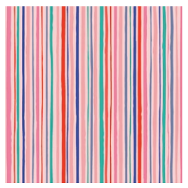
FWR-34882 FLOWER TIES