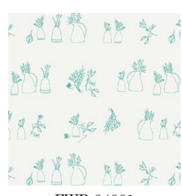
FWR-34881 GARDENING JOY