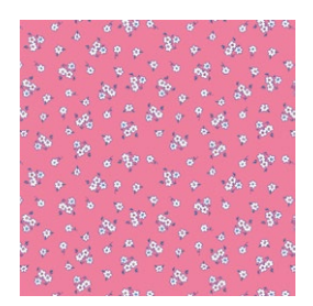
FWR-34885 DANCING DITSY