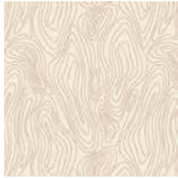
CAP-TK-1501 RIPPLING TERRAIN