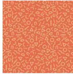
CAP-TK-1509 TERRACOTTA MARKINGS