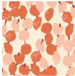
CAP-TK-1508 SCULPTED MOTIF