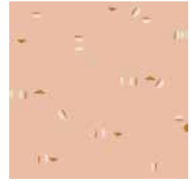
CAP-TK-1510 STENCILLED BLUSH