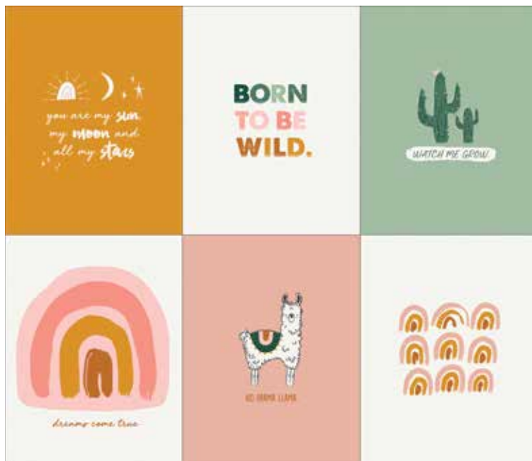
CAP-PA-1413 BORN TO BE WILD