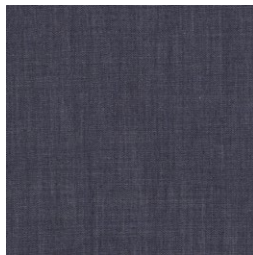
DEN-S-2001 INDIGO SHADOW