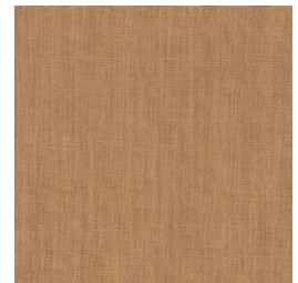
DEN-S-2006 ADOBE CLAY