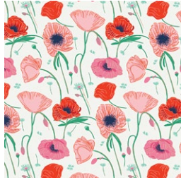
FWR-34884 POPPY HILL