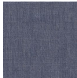
DEN-S-2003 AFTERNOON SAIL