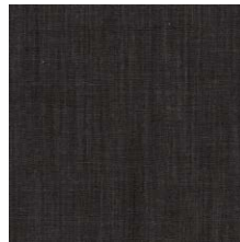
DEN-S-2000 WICKED SKY