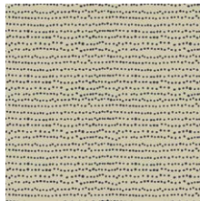
IFL-56301 FLECKS INDIGO