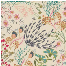
IFL-56302 MEADOW VIVID