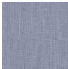
DEN-S-2004 INFUSED HYDRAN- GEA