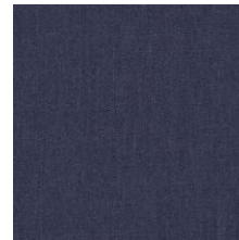
DEN-S-2008 CLASSIC DENIM