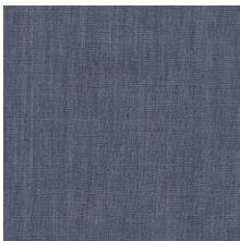
DEN-S-2003 AFTERNOON SAIL