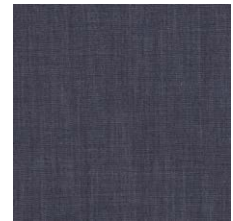
DEN-S-2001 INDIGO SHADOW