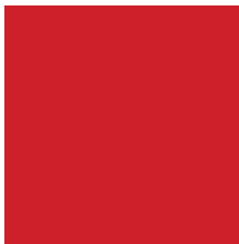
KS-130 TRUE RED