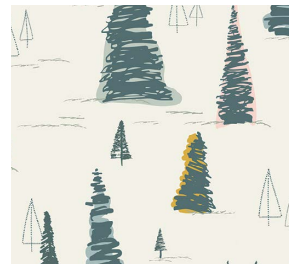
HRT-85303 PINETRE DAYBREAK by Pat Bravo