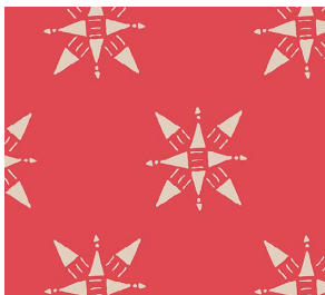
LVS-48808 COMPASSION RUBY by Maureen Cracknell