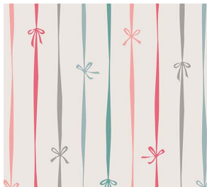
LTO-8237 BOWTIED by Amy Sinibaldi