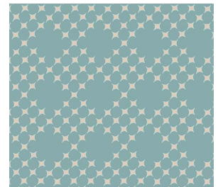
FCD-77154 PIXIE DUST SPARK by Maureen Cracknell