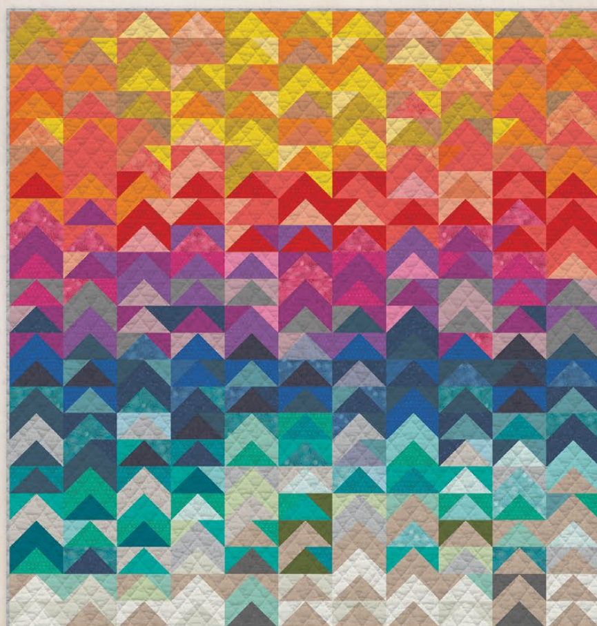
BON BINI SUNSET QUILT PATTERN 88" x 92" liveartgalleryfabrics.com/free-quilting-patterns/