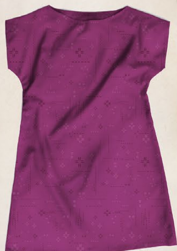
SIMPLY SEWING MAG WALKLEY DRESS