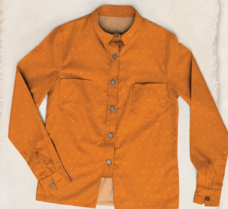
NAMED CLOTHING QUINN SHIRT