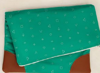
LGB STUDIO LEATHER ACCENT FOLD OVER POUCH