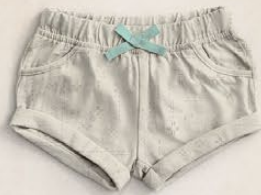
HEY THERE THREADS BABY BASIC SHORTS