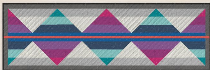
REVEAL TABLE RUNNER 16" x 50" liveartgalleryfabrics.com/free-sewing-patterns/