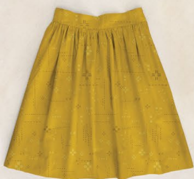
NAMED CLOTHING LUMME PLEATED SKIRT