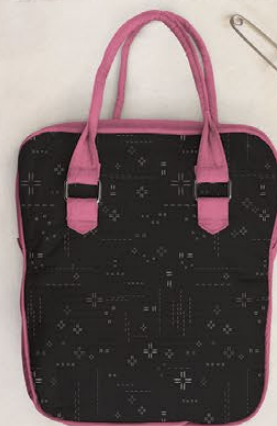
SASSAFRAS LANE DESIGNS BUBBA BOWLING BAG