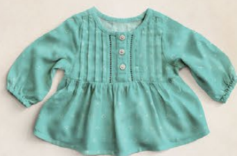
BUTTERICK - B6045