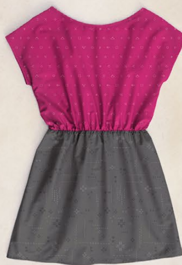
APRIL RHODES STAPLE DRESS