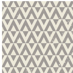
CAP-VC-5005 RUSTIC DIAMONDS