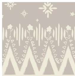
CAP-VC-5009 NOVA MEADOW