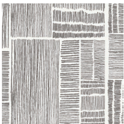
CAP-VC-5008 LABYRINTH IMPRESSION