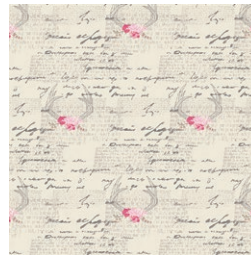
CAP-VC-5006 AMOROUS MANUSCRIPT