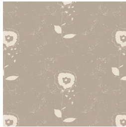
CAP-VC-5001 PICTURESQUE BLOOM