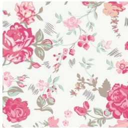
CAP-VC-5000 NOSTALGIC ROMANCE