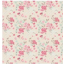
CAP-VC-5002 VINTAGE FLORETS