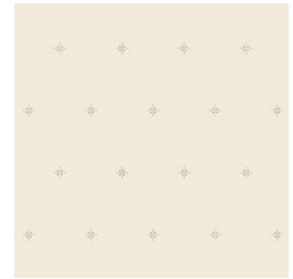
CAP-VC-5003 FAINT CHARMS ANTIQUE