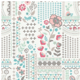
CAP-VC-5004 WONDERLUST FIELD