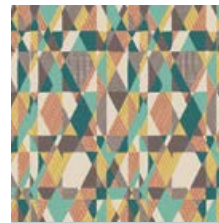
ART-53105 INTERWILL PATIENCE