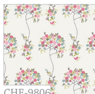
CHE-9806 Tree Fleur Blanc