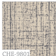
CHE-9801 En Route Sable