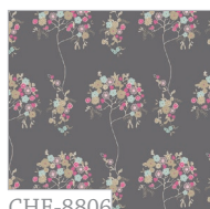
CHE-8806 Tree Fleur Sombre