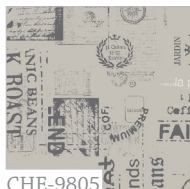
CHE-9805 Memorandum Lune