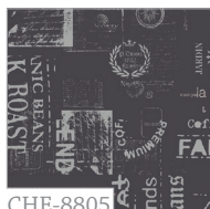
CHE-8805 Memorandum Cosmos