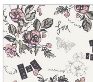
CHE-8802 Joie De Vivre Ivoire