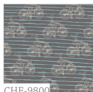
CHE-9800 Bon Voyage Noir