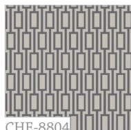
CHE-8804 Motif Antique