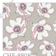
CHE-8808 Plummet Magnolia