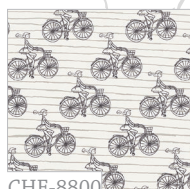
CHE-8800 Bon Voyage Lumiere