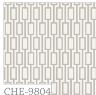
CHE-9804 Motif Avant-Garde