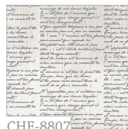
CHE-8807 Telegrammes Nuage