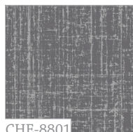
CHE-8801 En Route Gravel