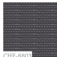
CHE-8803 Les Points Dust