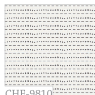
CHE-9810 Les Points Powder