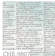
CHE-9807 Telegrammes Ciel