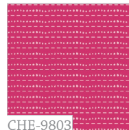
CHE-9803 Les Points Rose