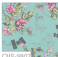
CHE-9802 Joi De Vivre Beryl