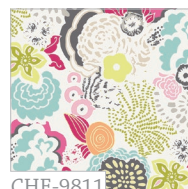
CHE-9811 Decoupage Couleur