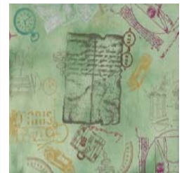
P 304 SAGE