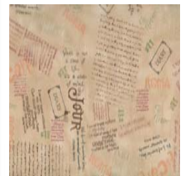
P 300 TERRA