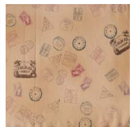
P 301 OCHRE