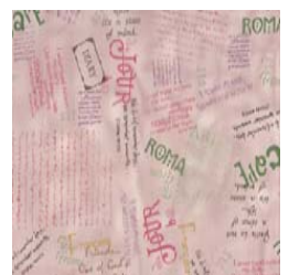
P 300 LAVENDER