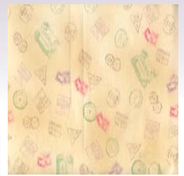
P 301 ECRU