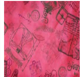
P 304 WINE