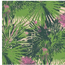
FUS-RF-1505 TROPICAL RAINFOREST