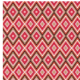
FUS-RF-1506 KILIM INHERIT RAINFOREST