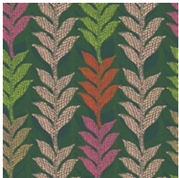
FUS-RF-1502 LAMINA RAINFOREST