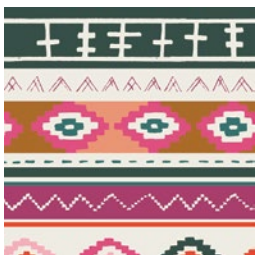
FUS-RF-1509 BOUND RAINFOREST