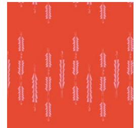
FUS-RF-1503 AURA FLETCHINGS RAINFOREST