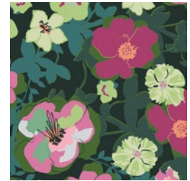
FUS-RF-1507 BLOMMA GARDEN RAINFOREST