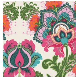
FUS-RF-1500 ARTISAN RAINFOREST