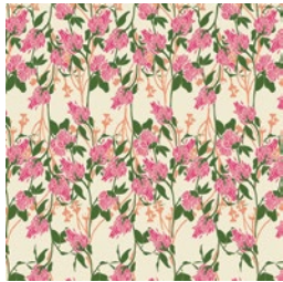
FUS-RF-1504 CLOVER GROVE RAINFOREST