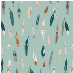
CAP-C-9004 HEATHER & FEATHERS