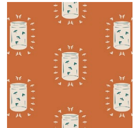
CAP-C-9007 FIREFLIES GLOW