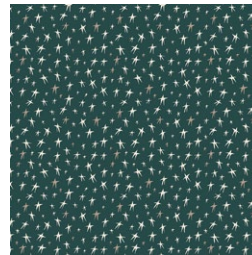
CAP-C-9006 MIDNIGHT WISHES