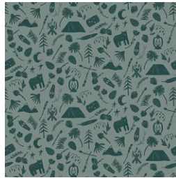
CAP-C-9001 CAMPING STORIES