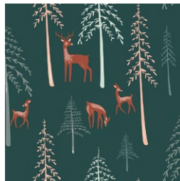
CAP-C-9009 AMONG THE PINES