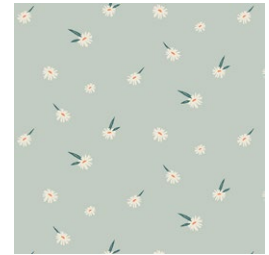
CAP-C-9003 DANCING DAISIES