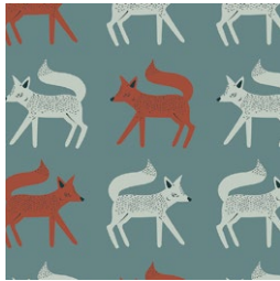
CAP-C-9000 SNEAKY LITTLE FOXES