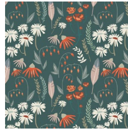
CAP-C-9002 WILD GATHERINGS