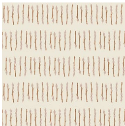
CAP-C-9008 CAMPFIRE SWEETS