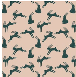
CAP-C-9005 HOPPING HARE