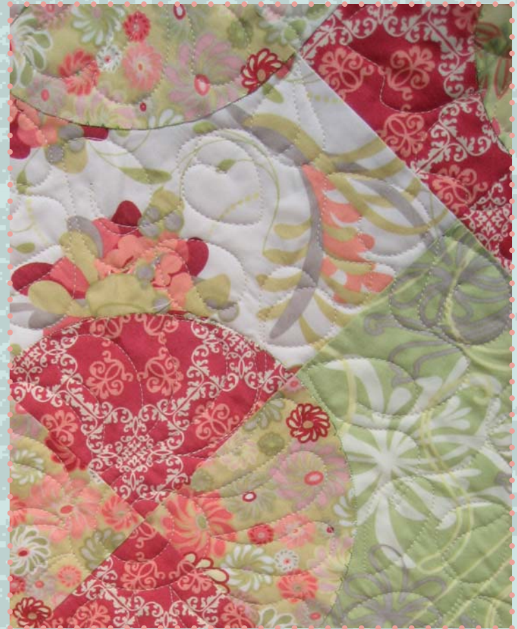
Perfect appliquéd quarter circles

It's so easy, that you only have to cut squares for your blocks. Forget acrylic templates for ever..